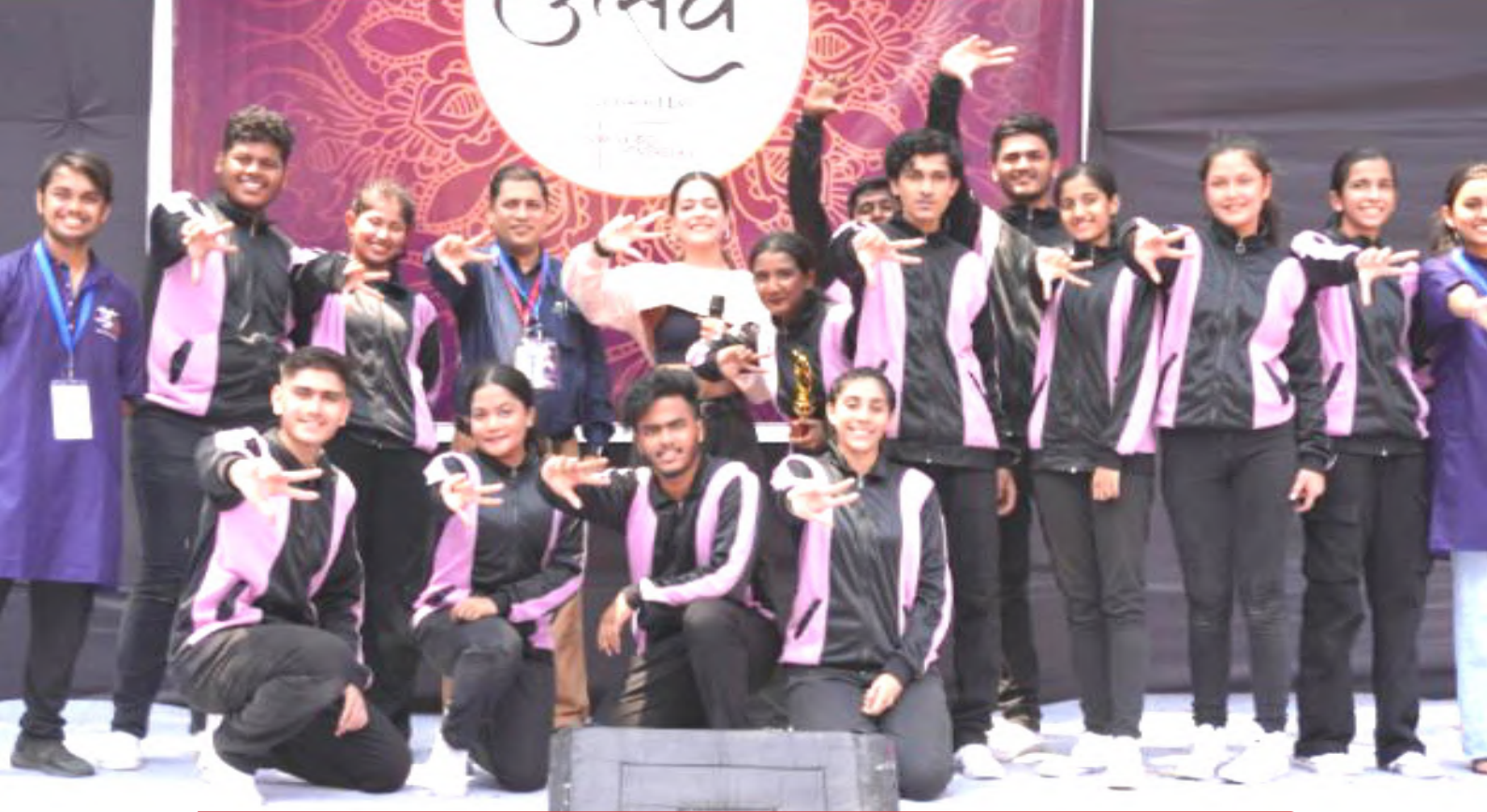
Second Runners Up at Association of Indian University Program 2023-2024