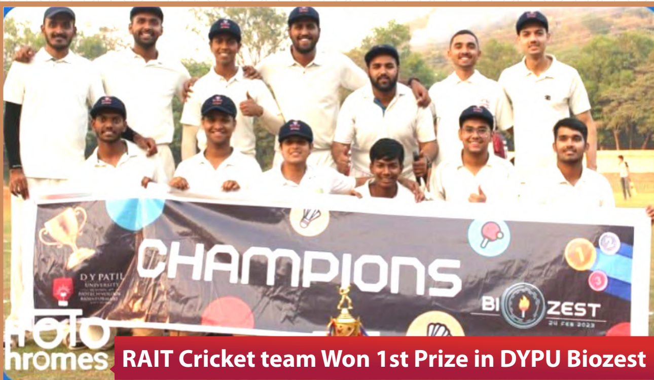
RAIT Cricket team Won 1st Prize in DYPU Biozest