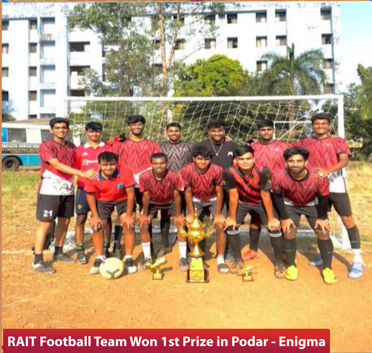
RAIT Football Team Won 1st Prize in Podar - Enigma