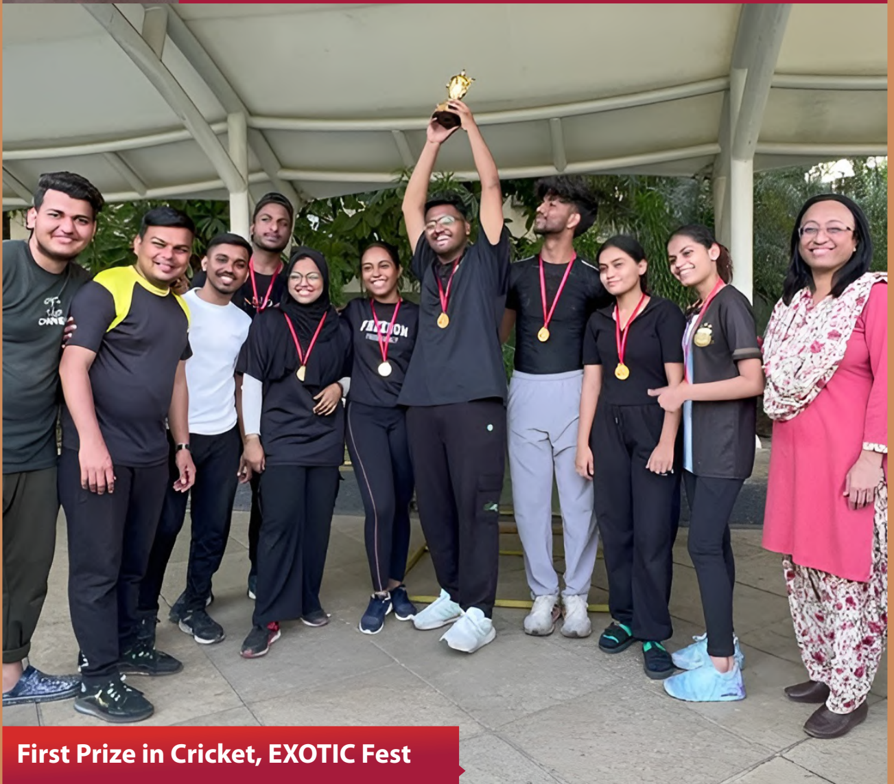
First Prize in Cricket, EXOTIC Fest