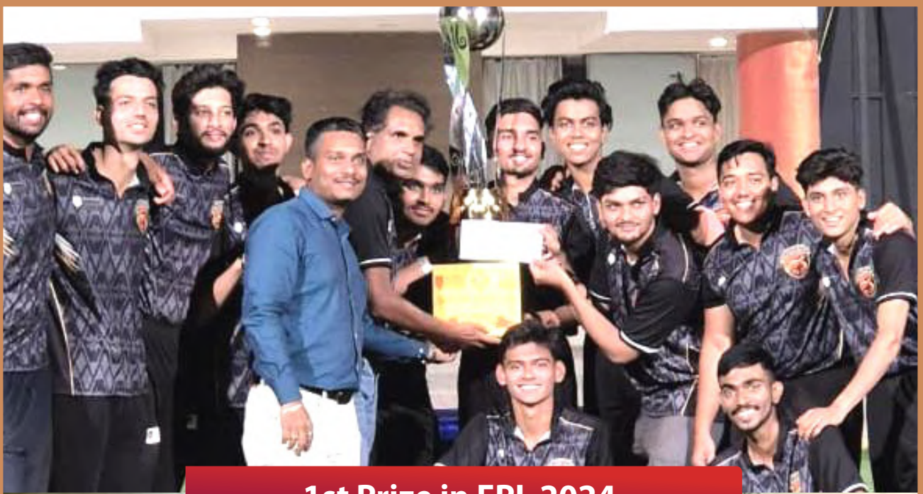
1st Prize in EPL 2024