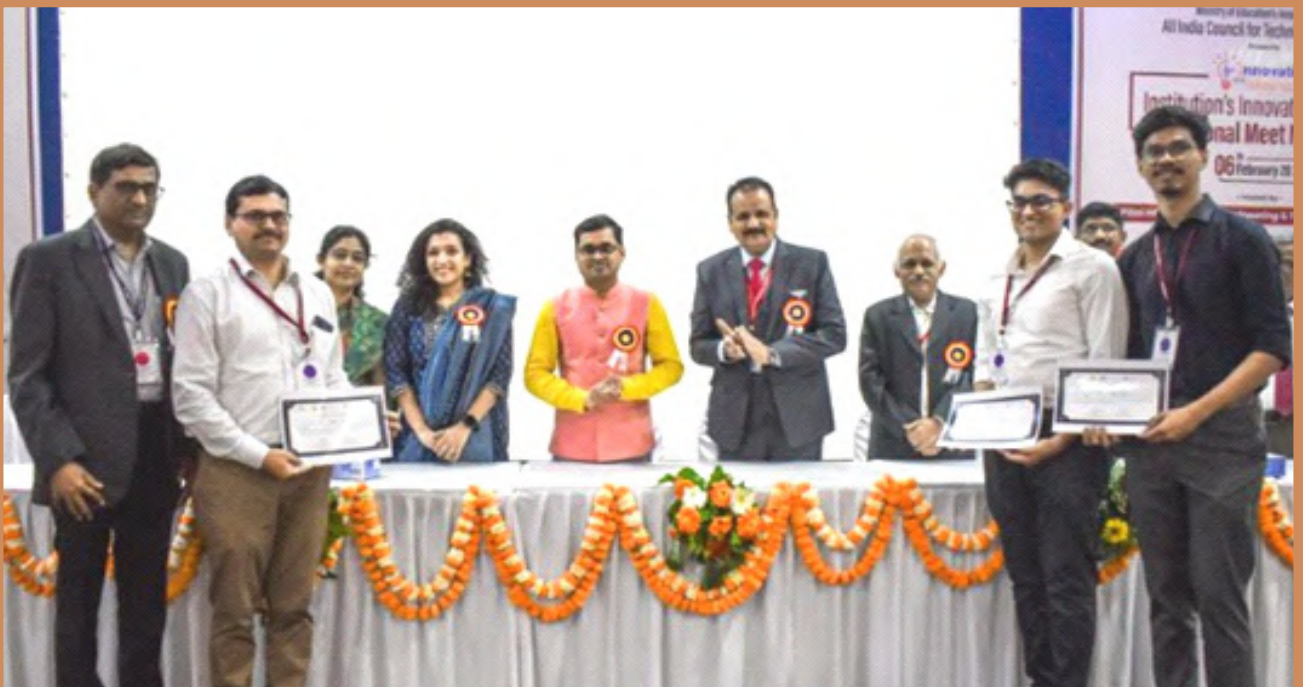
First Prize in Annasaheb Dange College of engineering and technology